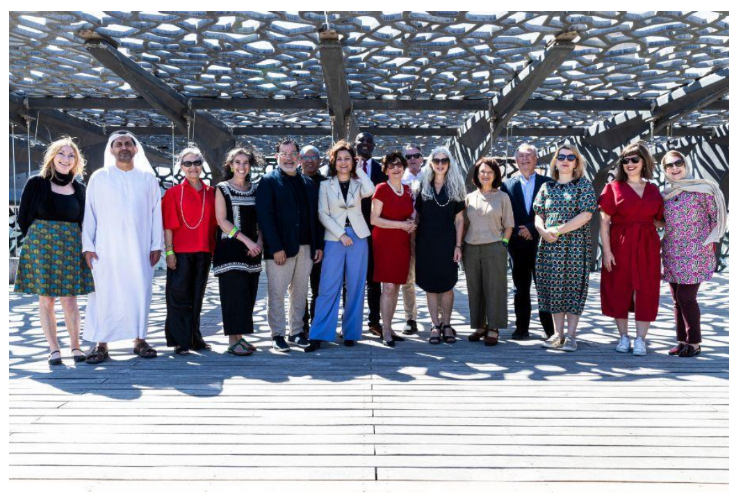
2024 ICOM's Executive Board, Mucem in Marseilles

Declaration of Funchal The Portuguese federation updates the Funchal Declaration, signed between ICOM Europe and WFFM at our 2018 General Assembly in Madeira, for presentation in Lisbon on the European Day of Friends of Museum, 13 October