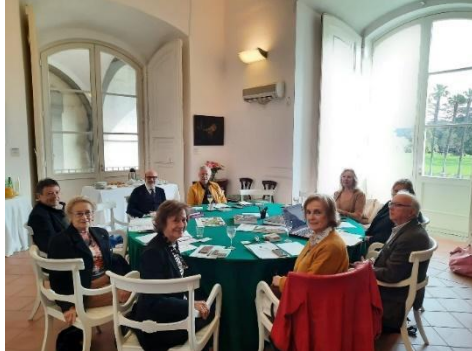
WFFM Europe, Capodeimonte, Naples 2023